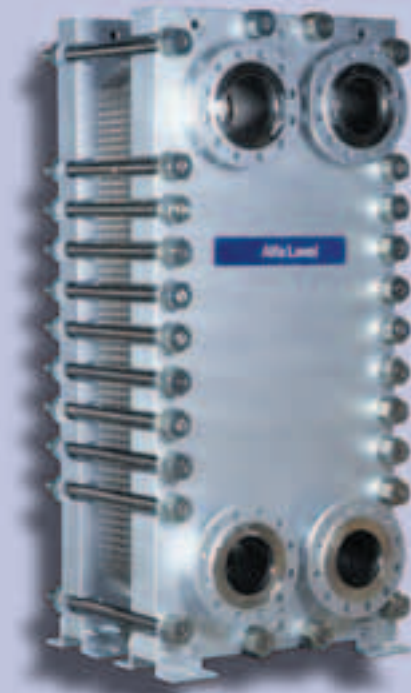
AlfaRex TM20 - All welded Plate Heat Exchanger

The construction only utilizes welding in the plane of the plate i.e. in two directions thereby avoiding welds in a third direction. This design ensures retained flexibility of the plate pack allowing for thermal and hydraulic expansions and contractions which will reduce the risk for fatigue cracks.